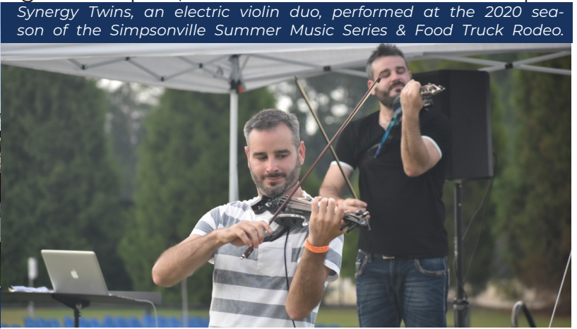
Synergy Twins, an electric violin duo, performed at the 2020 season of the Simpsonville Summer Music Series & Food Truck Rodeo.