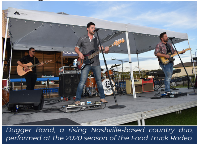
Dugger Band, a rising Nashville-based country duo, performed at the 2020 season of the Food Truck Rodeo.