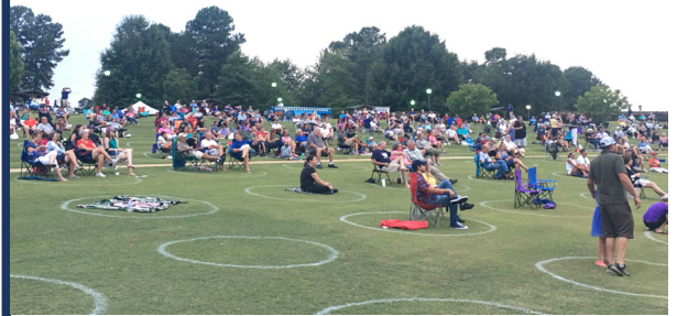
The Simpsonville Summer Music Series & Food Truck Rodeo was a success in 2020 due to measures taken to help prevent the spread of COVID-19, such as social distancing.