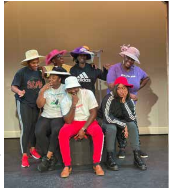
The cast of CROWNS rehearses in September. CROWNS uses hats to tell stories about the Black experience | No Dreams Deferred