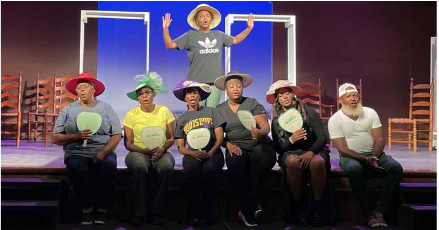
CROWNS is an exploration of Black history and identity as seen through the eyes of a young Black woman who has come down South to stay with her aunt after her brother is killed in Brooklyn, N.Y. Characters use hats of exquisite variety to tell tales about the etiquette of hats and their historical and contemporary social functioning | No Dreams Deferred

Tickets for CROWNS are on sale now on eventbrite.com .