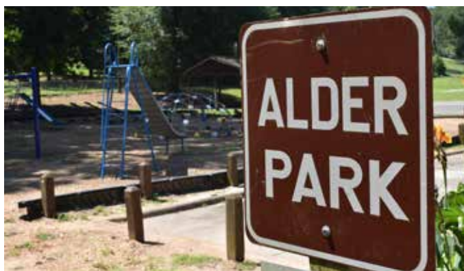
Alder Park features paved trails, basketball court, field for soccer or flag football, picnic shelter and playground.

Alder Park is a second neighborhood park located in the Westwood community off Alder Drive.