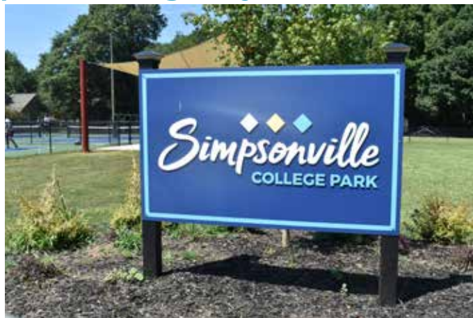
College Park features pickleball courts, playground, baseball field, basketball court and community garden Harmony Garden.