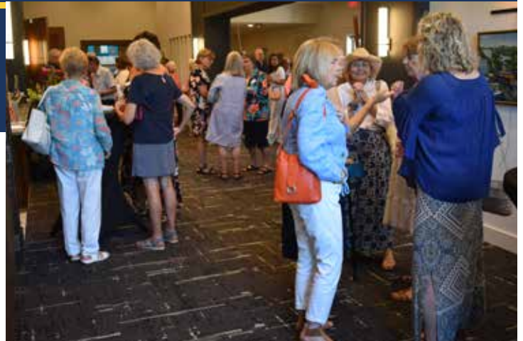
The Simpsonville Arts Center hosted an opening for the Senior Artists Showcase art exhibition on Aug. 31 in the Lobby Art Gallery.