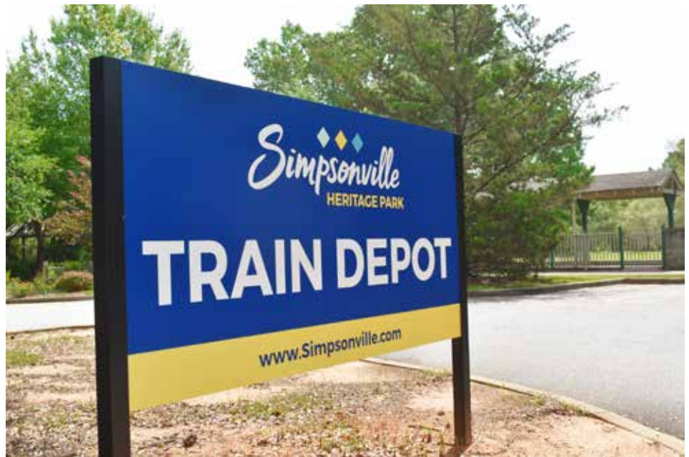
Heritage Park is home to Heritage Park Railway, which features an operable miniature steam train for the young and young at heart to enjoy.

DOGS ARE PERMITTED IN THE FOLLOWING PARKS: