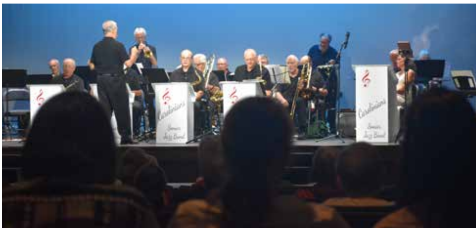
The Carolinians Senior Jazz Band performed a free concert for attendees of the Senior Artists Showcase art exhibition on Aug. 31 in the auditorium.

The Simpsonville Arts Center hosts several art exhibitions in the Lobby Art Gallery throughout the year. Visit simpsonvilleartscenter.com/events for more information.