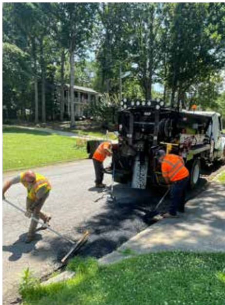
The Public Works Streets & Sewer Division maintains 85 miles of city-owned streets, 113 miles of sewer and more than 4,000 manholes.