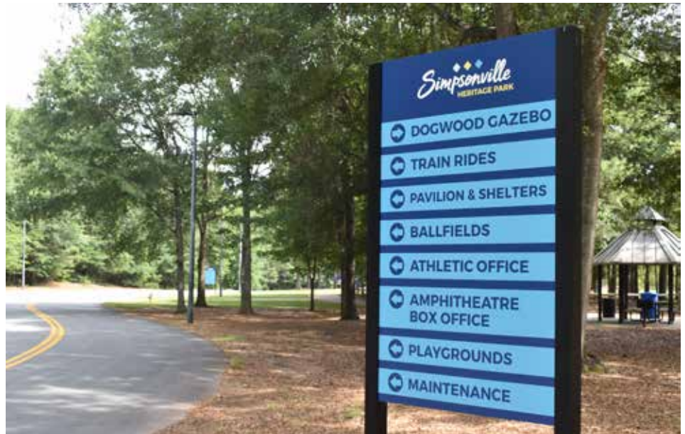
Heritage Park is located off South East Main Street and serves host to Simpsonville Athletics, a miniature train and the CCNB Amphitheatre.