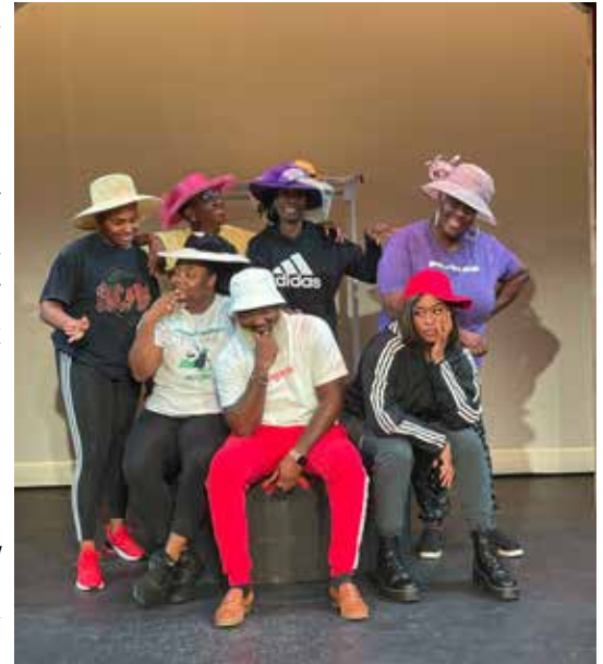
The cast of CROWNS rehearses in September. CROWNS uses hats to tell stories about the Black experience | No Dreams Deferred