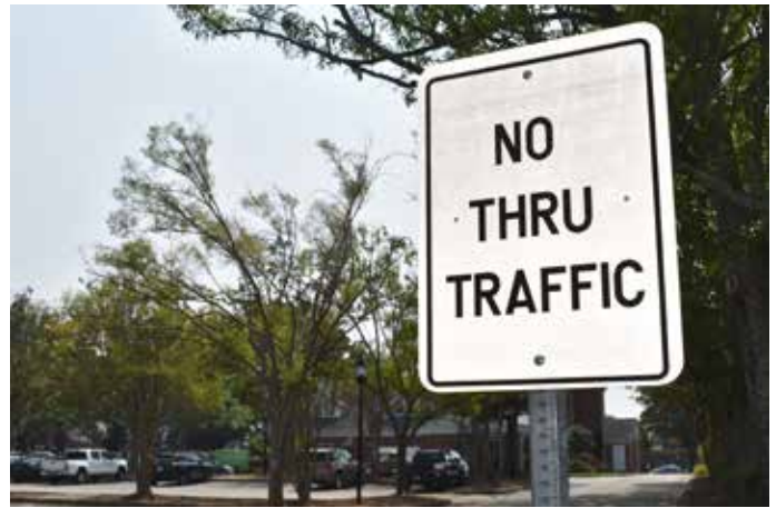
An ordinance passed by Simpsonville City Council permits police to issue citations for cutting through parking lots.

“As roadways have become more congested, there’s been an increase