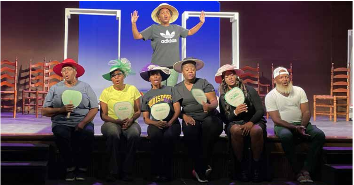
CROWNS is an exploration of Black history and identity as seen through the eyes of a young Black woman who has come down South to stay with her aunt after her brother is killed in Brooklyn, N.Y. Characters use hats of exquisite variety to tell tales about the etiquette of hats and their historical and contemporary social functioning | No Dreams Deferred

Tickets for CROWNS are on sale now on eventbrite.com .