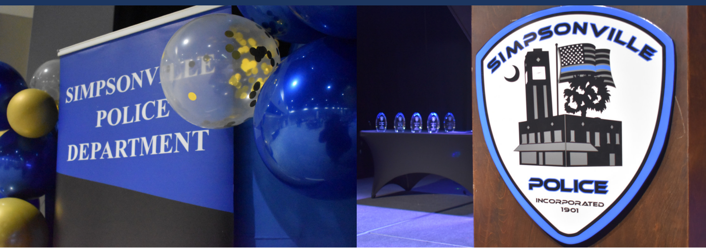
SIMPSONVILLE PD HOLDS 2024 BANQUET OFFICERS, STAFF RECOGNIZED