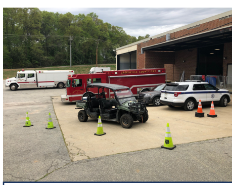
Multiple agencies, both state and local, have pitched in to testfirst responders for COVID-19 free of charge to protect their health and slow the spread of the virus.