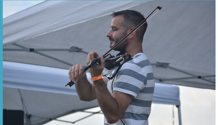
The violin duo Synergy Twins was the second act of the Music Series. Despite the rain, they played a great set.