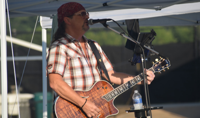
The Southern Rock band Reservoir Dogs opened up the Music Series in August on a perfect summer day.