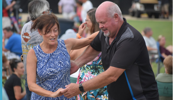
A pair at the Retro Vertigo concert enjoyed dancing on the spacious lawn at the CCNB Amphitheatre.