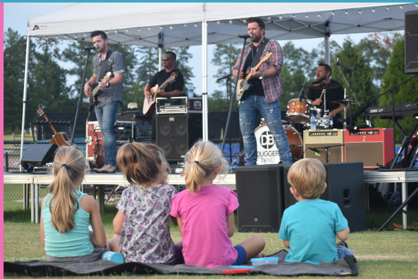
A group of children watch rising Nashville group Dugger Band, which played a combination of original tunes, 90s country and pop music. Simpsonville and SAFI look forward to hosting the 2021 season!