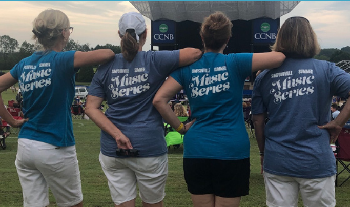
Members of the Simpsonville Arts Foundation enjoy a concert by the Chicago tribute band Chicago Rewired.