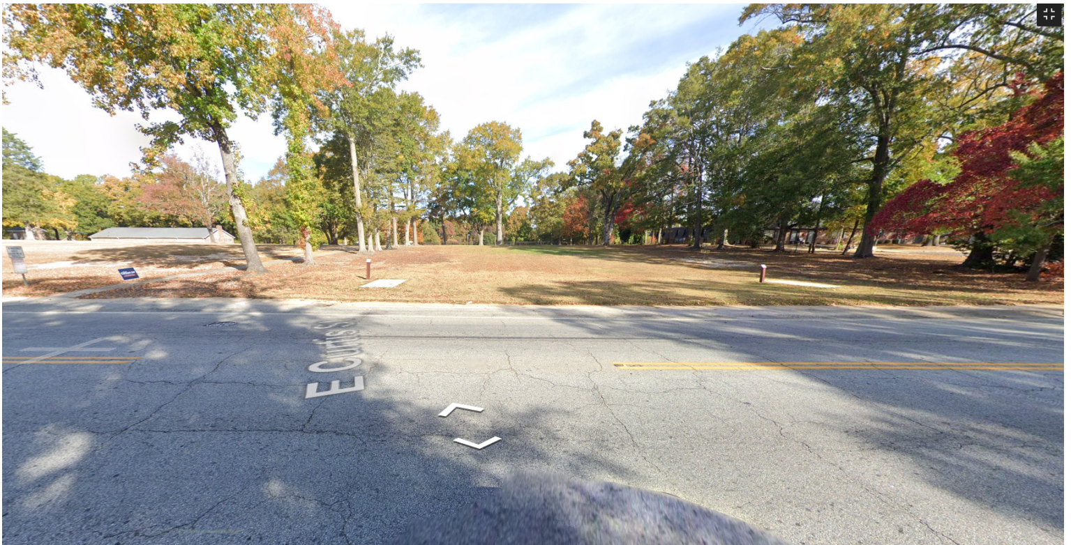
455 E. Curtis St. Simpsonville, SC 29681

Blank, windowless walls shall be prohibited where visible from any public right-of-way. Any façade visible from a public right-of-way shall incorporate windows and doorways that account for at least 25 percent of the façade, but not more than 85 percent of the façade. Where windows are used, they shall be transparent. Windows and doorways should incorporate decorative elements such as sills, trim, lintels, transoms, and awnings. Where windows are not feasible, alternative fenestration techniques, meeting the intent of the Ordinance, may be approved by the Planning Commission