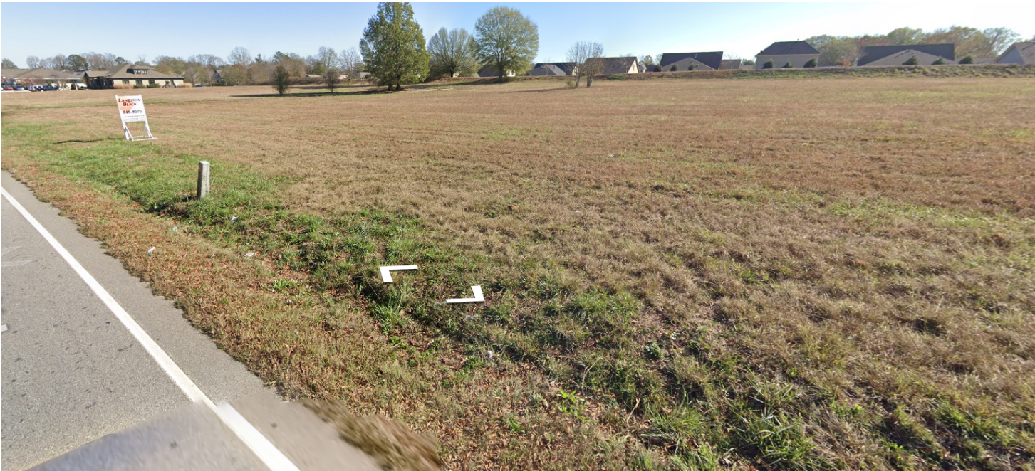
562 Harrison Bridge Rd.

Before any plat may be approved or any development permits issued, a master site plan must be approved by the Planning Commission.